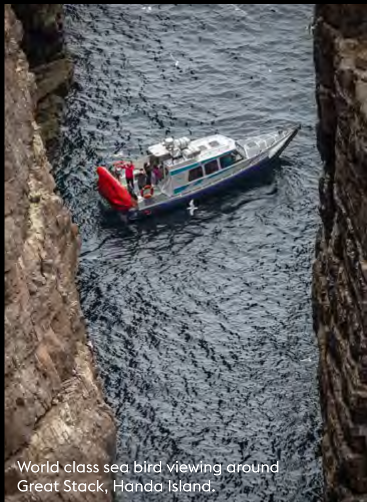
World class sea bird viewing around Great Stack, Handa Island.